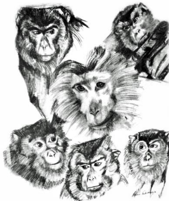
Charcoal drawing by Karen Dortenzio.

https://smile.amazon.com/Six-Macques-Transformation-Primates-Ambassadors-ebook/dp/B01HCQXTC0/ref=smi_www_rco2_go_smi_2609328962?_encoding=UTF8&ie=UTF8&psc=1&refRID=MR3Y2656Q2MWHBG85Q82